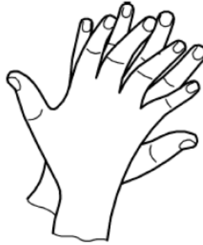
Step 2 Right palm over left dorsum and left palm over right dorsum (five times)