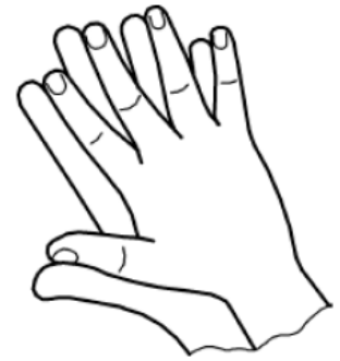
Step 3 Palm to palm with fingers interlaced (five times)