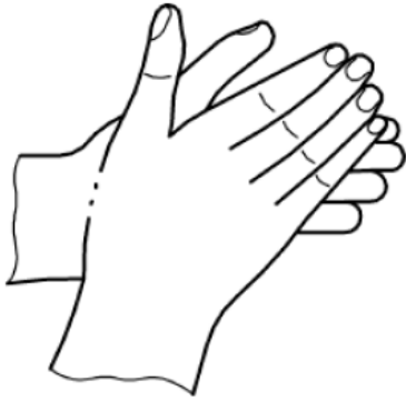
Step 1 Palm to palm