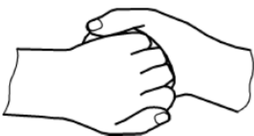
Step 4 Backs of fingers to opposing palms with fingers interlocked (five times)